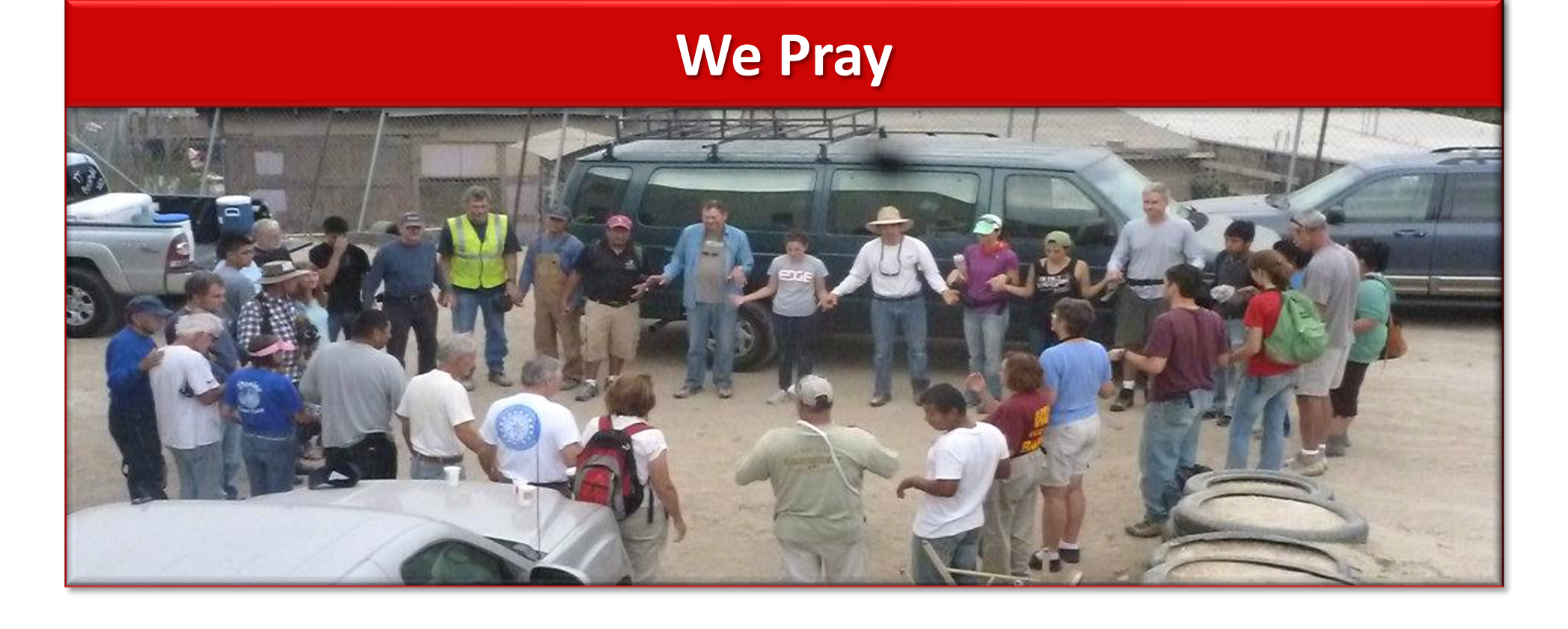
Lord Jesus, Carpenter and Healer,

We ask that you look upon the multitudes in Tijuana who have too little to eat, have too little shelter, and struggle each day to find work and ways to care for their family. We pray for the sick who have little resources to be healed. We ask you to guide us and open our eyes and hearts to their plight. Help us to hear their voices and learn from their faith and wisdom. Show us how we can help. In your name we pray. Amen